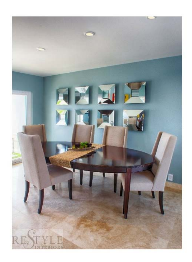
Mirror installation that makes the space!