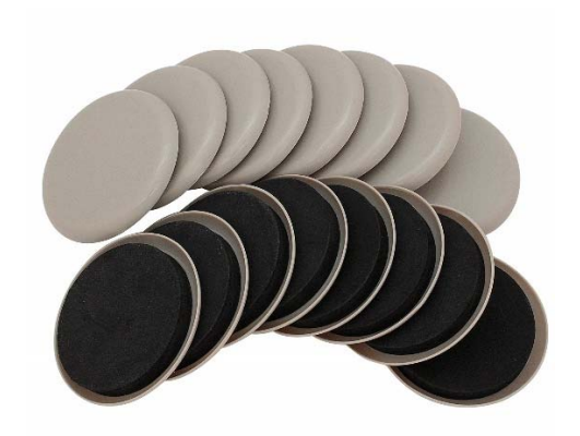
Step 1 – Dismantle the Room

First remove all the accessories from your space. This means you are clearing off all the furniture surfaces. Take this opportunity to de-clutter your space since you will only be putting back the items that compliment your new design. Place your items out of the way in an adjacent area so you can access them later. Keep the items you aren't bringing back separate from what you think you will be using. This saves you time later. #Suggestion: create a donation box for unwanted items and another box for questionable pieces.