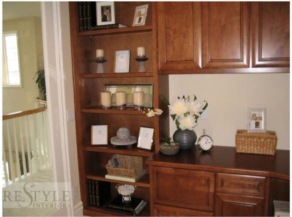
Accessorizing a built-in cabinet