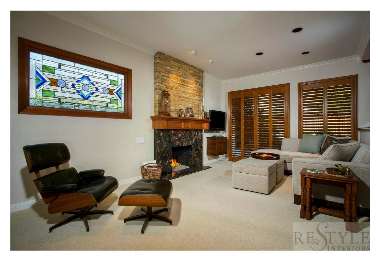
Focal Point, check! Balance & scale, check! Color & texture, check!