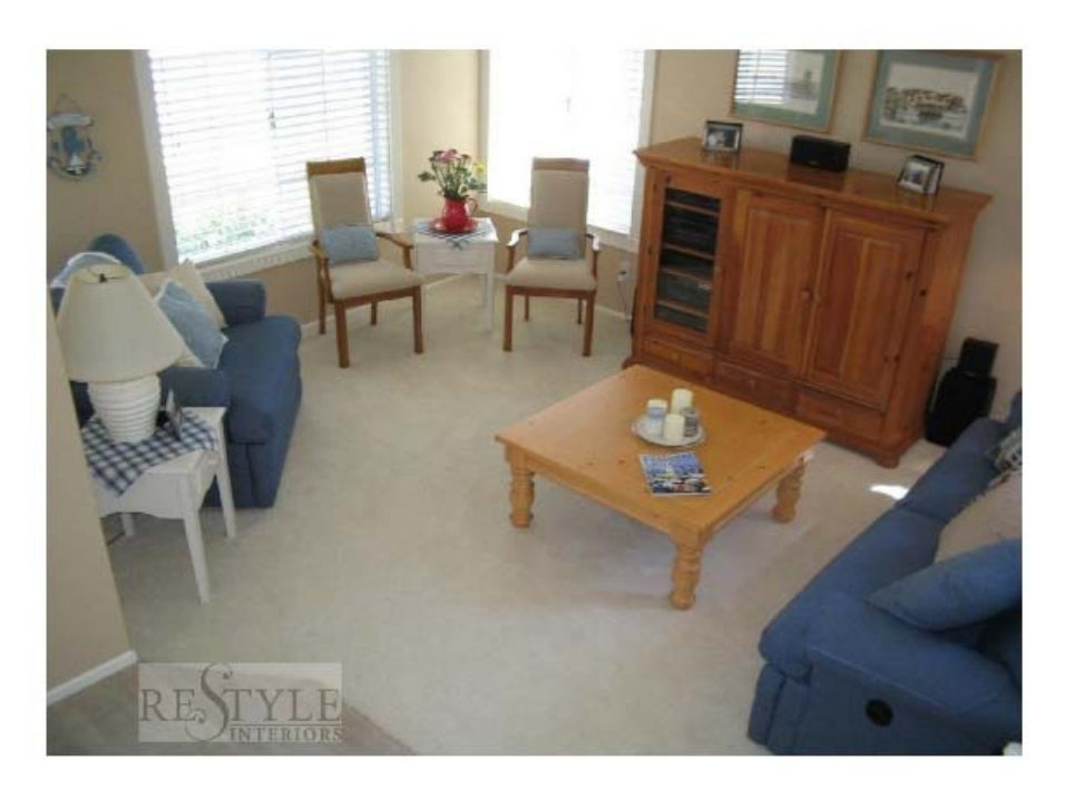
www. Re Style Interiors. net

Using angles in square rooms adds visual interest and opens up the space