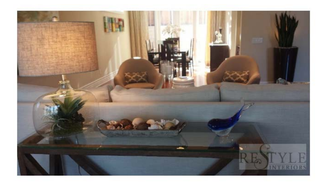
Dining room connects visually with complimenting colors and texture

Area rug anchors furniture setting in this bowling alley shaped room and the artwork does the talking!