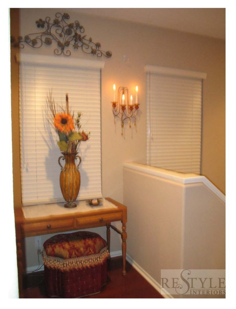
Show your staircase landing some Love!