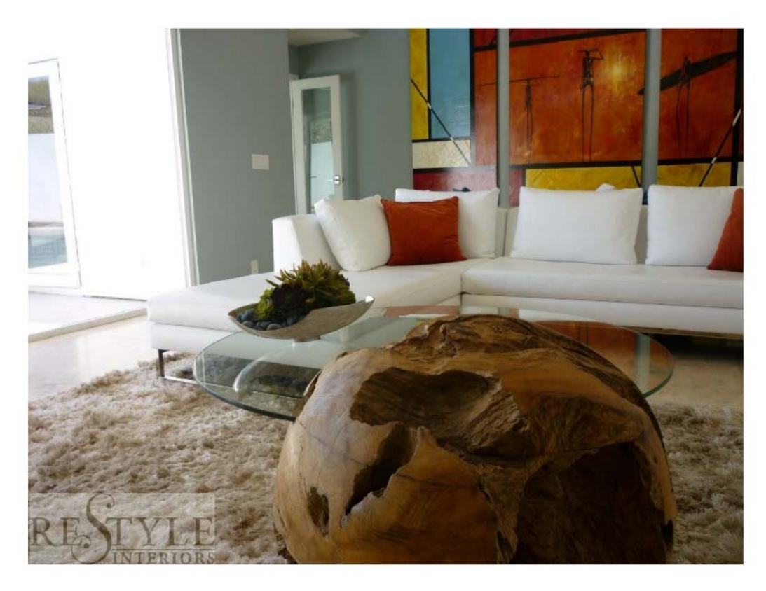
Texture warms up even the most minimal modern interiors!